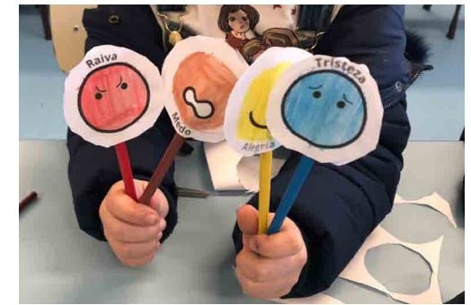
Example of the 4 pencils ↗ ↖

You can make four different thaumatropes, one for each emotion, and use each pencil depending on the emotion you have at the moment.